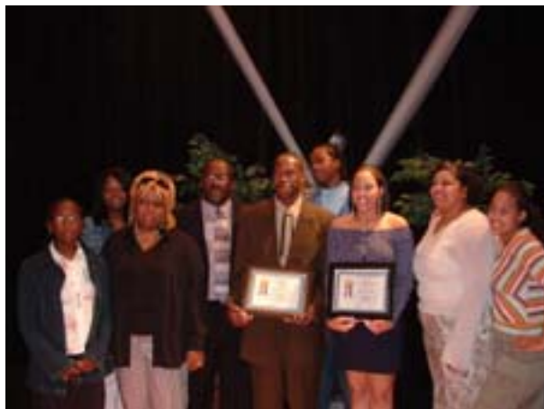
Proud Parents and Family